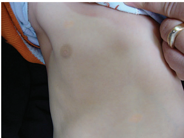
Figure 1. Two plane xanthomas on the abdomen and above nipple.

These findings were consistent with diffuse normolipemic plane xanthoma. It is necessary to perform further follow-up for patients with diffuse plane xanthomatosis because normolipemic plane xanthomas are often accompanied by myeloproliferative disorders such as leukemia, paraproteinemia, or lymphoma which may appear even years after skin manifestations. Therefore, our patient is under long-term clinical follow-up.