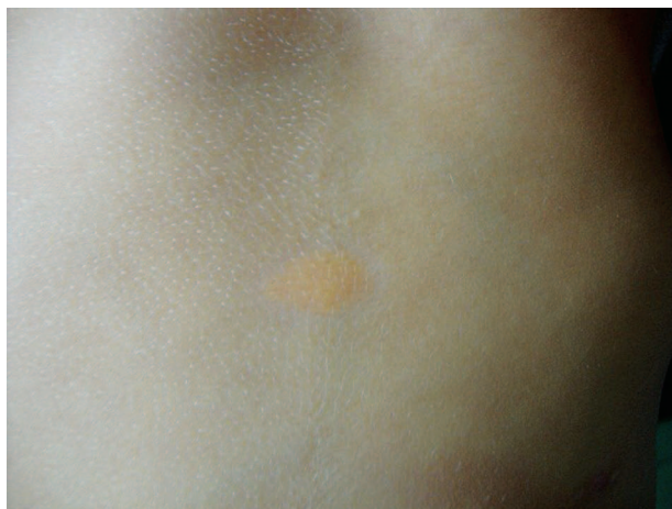
Figure 2. Larger view of the plane xanthoma on the abdomen