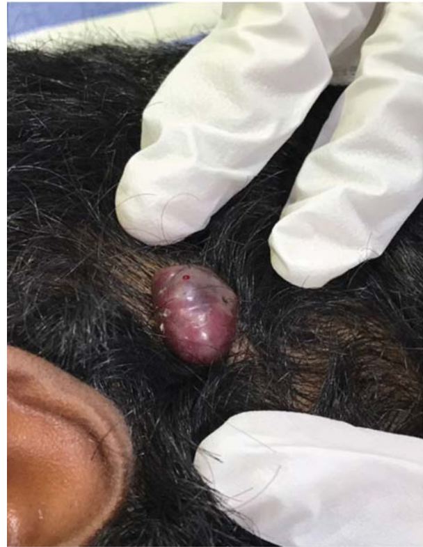
Figure 2. Visible blanching after sclerotherapy.