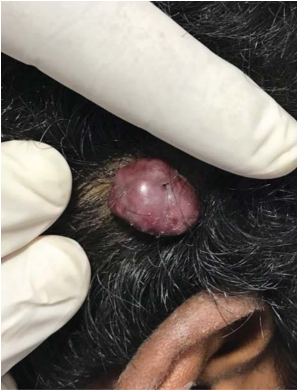
Figure 1. Pyogenic granuloma at the first visit.