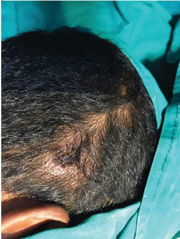
Figure 4. Complete resolution of the lesion.

pyogenic granuloma (PG) in 1897 4 . It was earlier known as 'botryomycosis hominis'. Hartzell, in 1904, coined the term 'pyogenic granuloma' (PG) or 'granuloma pyogenicum'; it is also known as Crocker and Hartzell's disease, lobular capillary hemangioma, and granuloma gravidarum (GG) in pregnant women 5 .