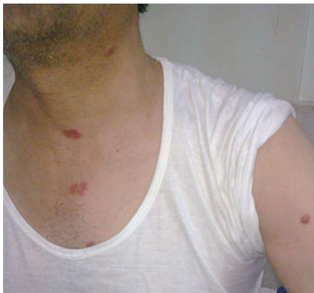
Figure 1. Multiple brown to reddish and slightly elevated papules and plaques

A 50-year-old man presented with a 6-month history of progressive developing cutaneous lesions following intravesical instillation of BCG. These lesions were neither painful nor itchy. According to his medical history, the patient underwent transurethral resection of a bladder tumor with a diagnosis of a grade II/IV noninvasive transitional-cell carcinoma 18 months ago and then received BCG maintenance instillation therapy. The first and second six BCG treatments were well tolerated. Six months prior to admission to the department of dermatology, the patient received his last BCG treatment (his 18 th BCG treatment overall). A few days after the last instillation, he developed generalized multiple granulomatous cutaneous lesions. He had no cough, dyspnea, fever or weakness. His family history was negative for bladder carcinoma. On physical examination, multiple brown to reddish and slightly elevated papules and plaques were observed all over his body, ranging from 1-10mm