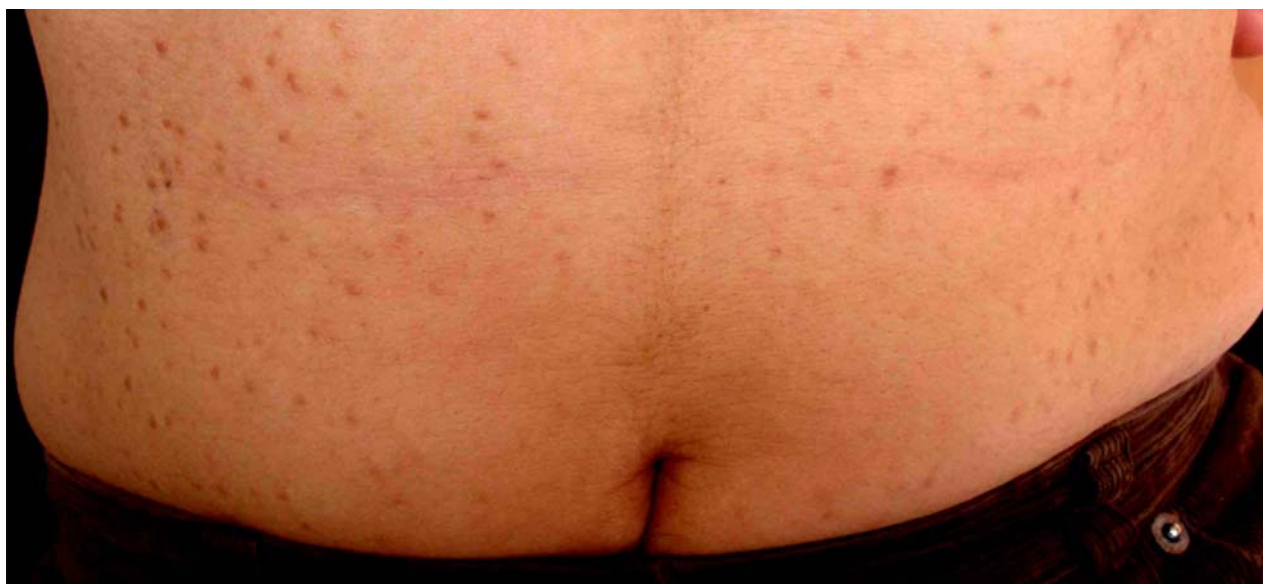
Figure 1. Bilateral and symmetrical erythematous papules on the lower abdomen.