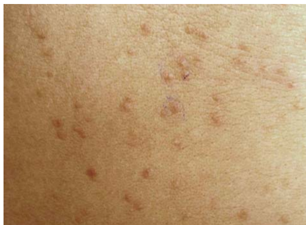
Figure 2. Syringoma: closer view of the abdominal lesions.