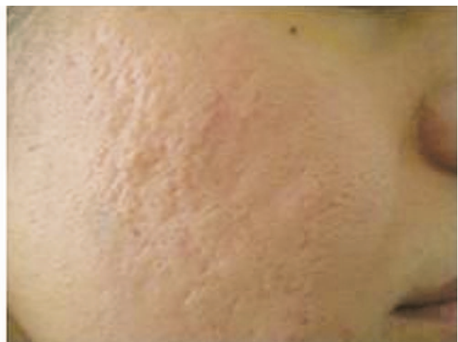
Figure 1. scar improvement after subcision

Investigators' ratings of improvement showed a significant difference between these two sides 3 months after the procedure ( p=0.0003 , Wilcoxon Test). The patients' assessment of efficacy also showed a significant difference with the use of suction 3 months after procedure ( p=0.0002 , Wilcoxon Test). The incidence of the adverse effects such as swelling, infection or bruising showed no