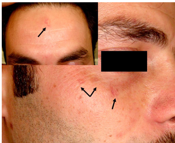
Figure 2: Multiple lesions with raised border and central atrophy

Several clinical forms have been reported each with differing morphology, distribution and clinical course, including: porokeratosis of Mibelli, linear porokeratosis, punctate porokeratosis, disseminated superficial porokeratosis, porokeratosis palmaris plantaris et disseminate and disseminated superficial actinic porokeratosis 1,2 . These various clinical presentations may be due to the different phenotypic expression of a common genetic abnormality or may be the consequence of abnormalities in closely linked genetic loci or genes. Apart from these five variants, a number of morphological features, such as facial porokeratosis, giant porokeratosis, punched out porokeratosis, hypertrophic verrucous porokeratosis (HVP), reticulate porokeratosis 3 and porokeratosis ptychotropica 4,5 have been reported in the literature.