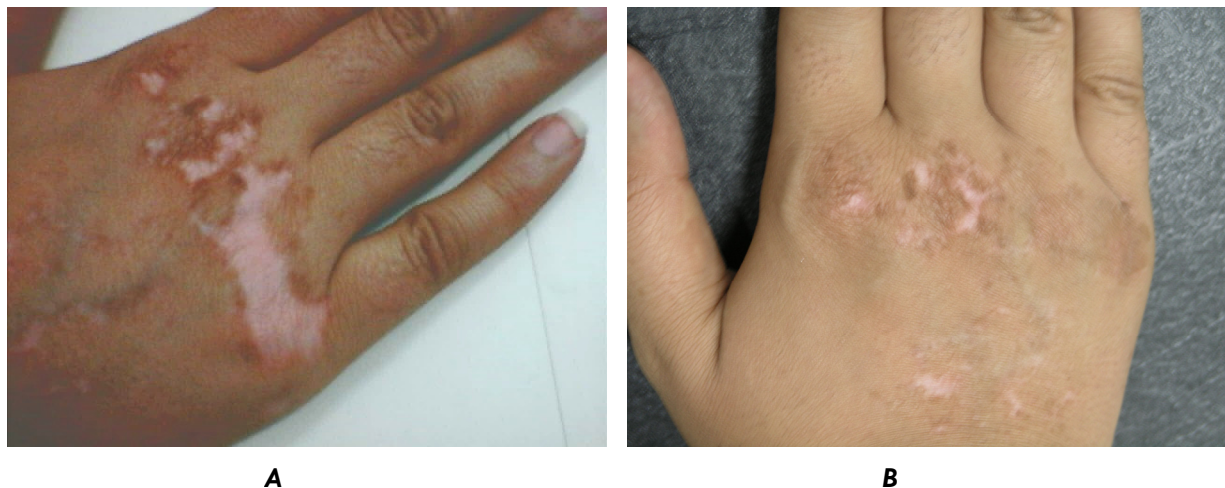
Figure 3: Patient No 2, a 27-year-old female patient with vitiligo over the dorsum of her right hand; A: patient before surgery, B: Same patient 2.5 months after blister graft surgery (complete repigmentation).