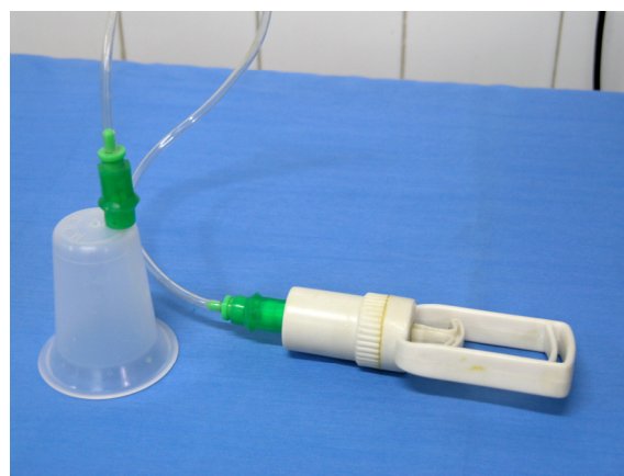
Figure 1: Vacuum device

When the recipient site got ready, graft was placed in the site and sutured with 6/0 nylon and then antibiotic ointment and vaseline gauze was put on it. To prevent disposition of the graft wet sterile