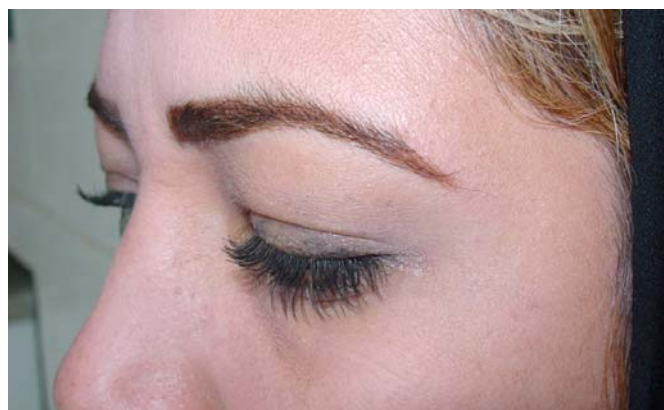
Fig 7: Improvement after treatment