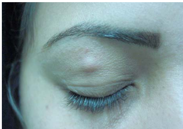
Fig 2: Upper eyelid involvement