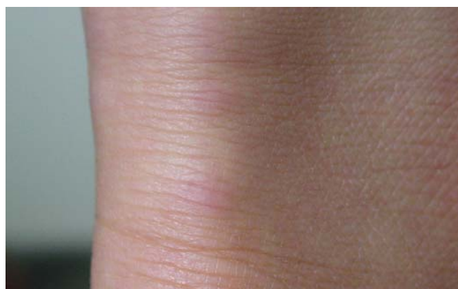
Fig 3: Achilles tendon involvement