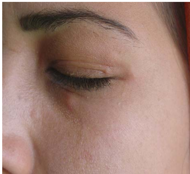
Fig 1: Upper and lower eyelid involvement

Complete blood cell count, fasting blood sugar, two-hour glucose tolerance-test and chest