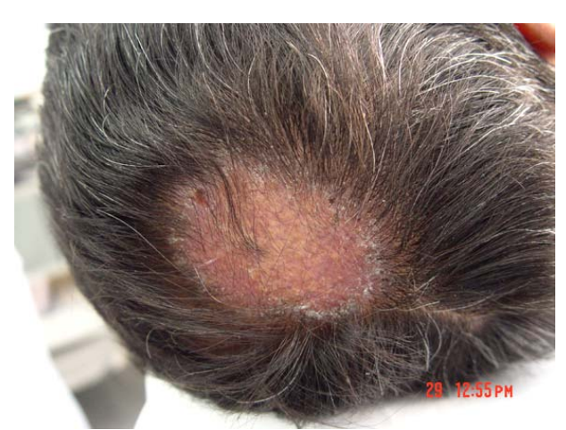
Figure 1. Yellowish coloured, annular plaque of cicatricial alopecia with scaly indurated margin associated with central atrophy and telangiectasia

Necrobiosis lipoidica diabeticorum (NLD) is a rare, chronic and granulomatous disorder that affects 0.3% of diabetic patients <sup>1-4</sup>. Typical lesions of NLD occur as irregular, ovoid plaques with a violaceous, indurated periphery and a yellow centeral atrophic area. In the later stage of development, visible telangiectasia on the surface is common. The most commonly affected site is the leg. Eighty- five percent of cases involve the legs exclusively and only 2% have no leg involvement <sup>5</sup>.