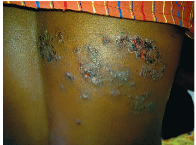
Figure 1. (a) Herpes zoster lesion before treatment with acyclovir. (b) Clinical improvement after 7 days of treatment with acyclovir.