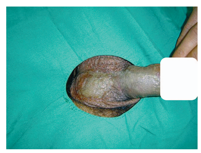
Figure 1. The erosive lesion on the ventral surface of the penis and scrotum.

Upon dermatologic examination, he was observed