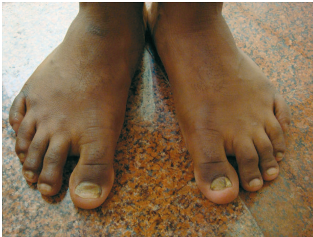
Figure 2. Rough, opaque, lusterless nails showing nail thinning and longitudinal striations on the toe nails.

It is a rare disease with only a handful of reports