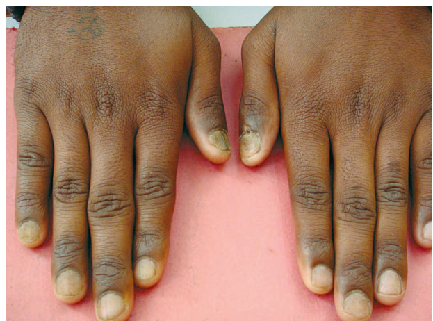
Figure 1. Rough, opaque, lusterless nails showing nail thinning and longitudinal striations on the finger nails.

department with dystrophy of all twenty nails for nine months. The changes were first noted in the finger nails followed by similar involvement of the toe nails. Nail examination was quite conspicuous and revealed the presence of alternating elevations and depressions (ridging) and/or pitting, lack of luster, roughening (similar to a sandpaper),