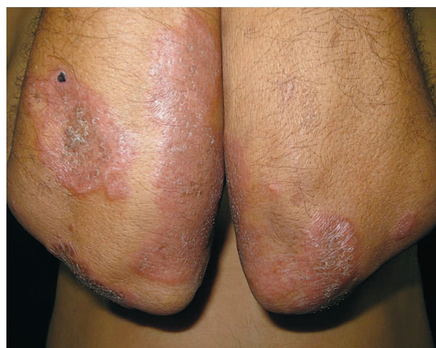
Figure 5. Haematoxylin & Eosin stained section of skin biopsy showing chronic granulomatous infiltrate with multiple non-caseating epithelioid cell granulomas without peripheral rim of lymphocytes in the papillary dermis. (×100)

Sarcoidosis may be acute or chronic. Acute sarcoidosis has an abrupt onset, is more frequent in Caucasians, and may present as Löfgren's syndrome which is characterized by bilateral hilar adenopathy, ankle arthritis, erythema nodosum, and frequently constitutional symptoms including fever, myalgia, malaise and weight loss. The prognosis is good and spontaneous remission usually occurs within two