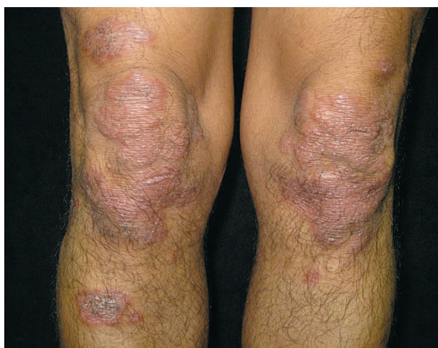
Figure 4. Computed tomography of the chest showing interstitial fibrotic changes in both the lungs fields.

Computed Tomography (HRCT) of the chest showed pretracheal, subcarinal and hilar lymphadenopathy, cystic spaces, reticulonodular opacities and interstitial fibrosis (Figure 4). Pulmonary function test showed a restrictive pattern with reduced Forced Vital Capacity (FVC) and normal FEV 1 . Ocular examination did not reveal any signs of uveitis. The patient did not give consent for broncho-alveolar lavage.