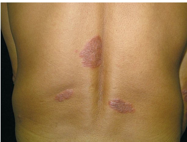
Figure 2. Well defined brown colored infiltrated plaques with peau d' orange appearance.

hypopigmented atrophic zone. Lesions on the lower back showed a granulomatous morphology with a peau d' orange appearance. (Figure 2) The rest of the examination of the oral cavity and genitalia did not show any abnormalities. There was no evidence of any peripheral nerve trunk enlargement or lesional loss of sensation. Deep dermal tenderness (Buschke Ollendorff sign) was not present. We considered a differential diagnosis of psoriasis vulgaris, psoriasiform sarcoidosis, and borderline lepromatous Hansen's disease.