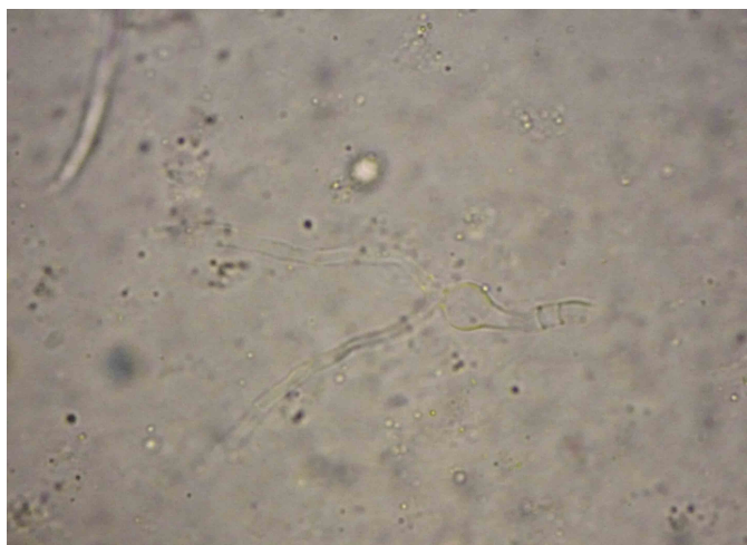
Figure 2. The 40x microscopy view of the mycelium of hyaline hyphomycetes ( Fusarium.sp ) which was separated from the wound exudates (Bar shows 4 \mu m).

Skin examination revealed a 7 × 5.5 cm erythematous indurated ulcerated oozing plaque with undermined edges on the dorsum of the right foot (Figure 1). No lymphedema, regional lymphadenopathy and hepatosplenomegaly was noted. The results of routine laboratory tests, including complete blood counts, blood chemistry, serum glucose, immunoglobulin, C3 and C4, and nitroblue tetrazolium test, were all within normal levels. Liver enzymes showed mild elevation (AST: 47 IU/L, ALT: 53 IU/L, Total Bilirubin: 1.5 mg /dl) and INR=1. HCV-Ab and PCR examination for HCV were both positive and HBS-Ag and HBS-Ab and anti HIV-Ab were all negative. Liver biopsy was not performed due to patient's refusal. Chest X-ray and X-rays of foot bones showed normal findings.