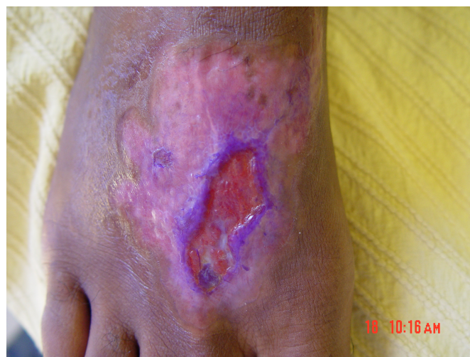
Figure 1b. The same ulcer after two months of itraconazole therapy.