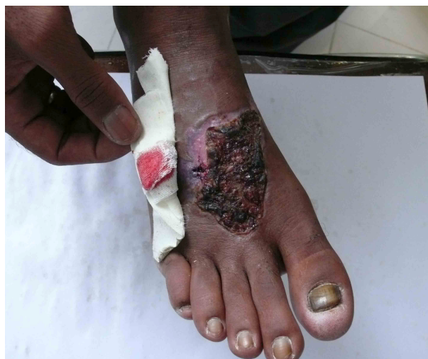
Figure 1a. Foot ulcer due to fusarium sp. before treatment

reddish papule at the site of a previous insect bite and gradually became ulcerated. The ulcer was irresponsive to usual topical disinfectants and different oral antibiotics. He was a known case of hepatitis C for 11 years but was not on any anti-hepatitis medication. He started smoking opium when he was 16 but he was not an intra-venous drug user.